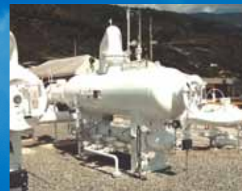
Filter or filter / separator section Horizontal filter separator