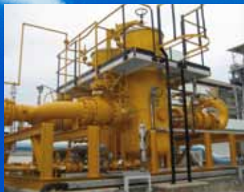
Filter or filter / separator section Baffle plate / coalescer separator