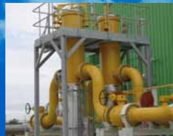
Filter or filter / separator section Cyclone / cellulose separator