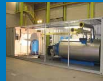
Hot water generator package