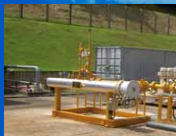
Heating section Electrical heater