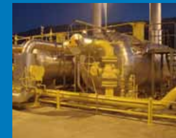
Heating section Waterbath heater

Petrogas is a source of inspired solutions where nature and technology meet. We build partnerships with our customers. We take proven engineering and enhance it with innovative technology. We provide service and support to create an environment in which you immediately feel comfortable. Petrogas develops, manufactures and supplies turnkey gas installations such as metering and regulating stations, dehydration units and LPG systems.