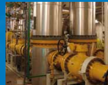
Heating section Shell and tube heat exchanger