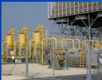
Knock-out drum section